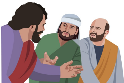
Matthias Chosen to Replace Judas