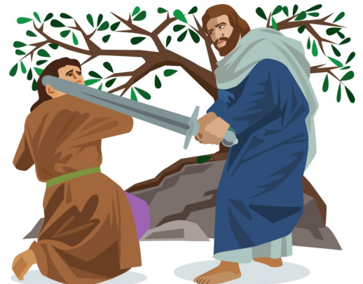
Peter Strikes Malchus